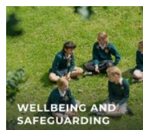
WELLBEING AND SAFEGUARDING

Education experiences at TGS are for all to access. Thanks to Wellbeing, SEND, and individual financial support; Pitchford, Debney Endowment Trust, for Pupil Premium and Sixth Form Promise.