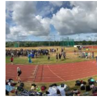
Sport for all