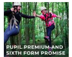
PUPIL PREMIUM AND SIXTH FORM PROMISE

Supporting TGS - Getting Involved - Helping at PTA events