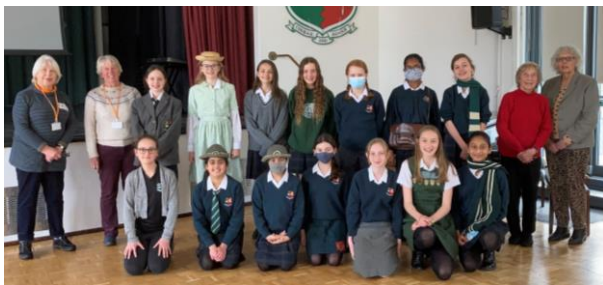
31 March 2022 Joy's Legacy Programme annual event, hosted by Year 7, including an archive tour and modelling old school uniform

Corporate Sponsorship offer TGS offers invoiced sponsorship packages and recognition, starting £250, £500, £1000 and POA.