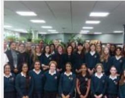
Library Reopening with Victoria Hislop

School News publishes lots of examples of alumni, parents and carers, students, and friends of TGS giving time, expertise, and celebrating the life of Tonbridge Grammar School.