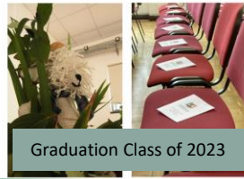
Graduation Class of 2023